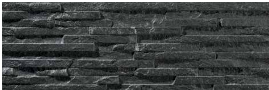
| 7 x 20 |